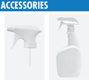
Ref# 3519 Unlabeled empty quart bottle with

For more information, visit palmerohealth.com, email customerservice@palmerohealth.com or call 800.344.6424.