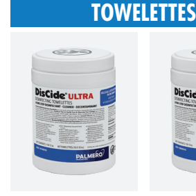
Ref# 10DIS 10" x 10" towelettes 60 count canister