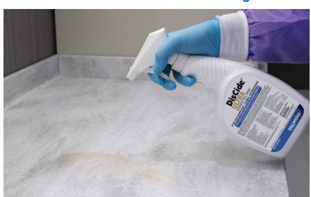
Step 1: Spray hard non-porous surface with DisCide Ultra Spray to help loosen bioburden.