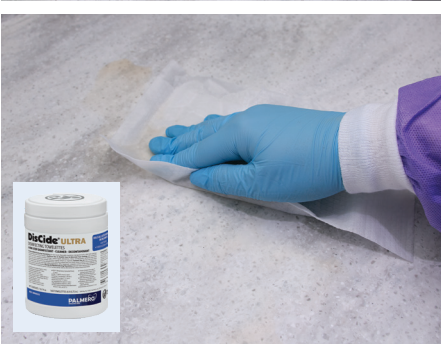
Step 2: Wipe down the surface with a DisCide Ultra towelette to remove debris and bioburden.